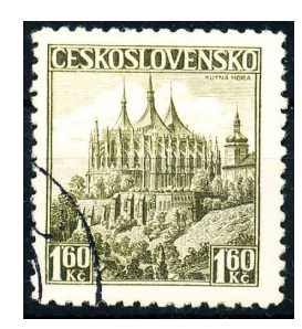
A stamp from the former Czechoslovakia

Over the last one hundred years, politics played a huge part on the European Continent. Let's look at a country formerly called Czechoslovakia. Following the end of the 1<sup>st</sup> World War, Czechoslovakia was formed in 1918 with the splintering of the Austro-