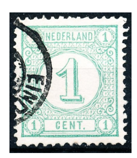
Scot Catalogue # 35. Look at the centering of the design and neat cancellation.

the years, focus has become very specialized. And that is my definition of what a philatelist is, a stamp collector who has searched and found differences between copies of the same stamp. The origin of the term philatelist is from the Greek language. Philo is defined as "lover of" and ateleia is "freedom from payment of tax." So the receiver of a letter affixed with a postage stamp is freed from paying the tax for the service received.<sup>2</sup> The Free Dictionary further defines philately as "the collection and study of postage stamps, postmarks, and related materials."